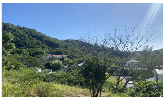
Valley Church Land